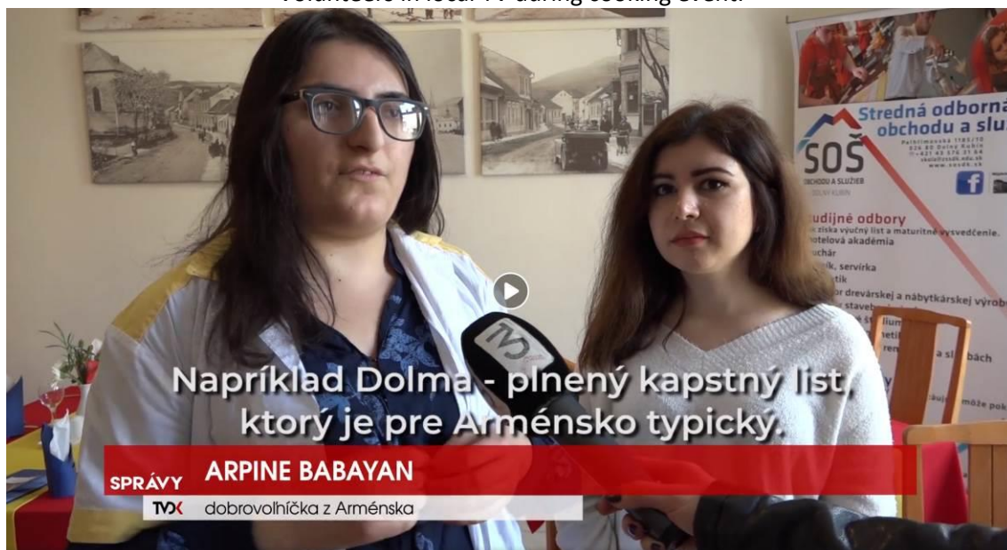
Volunteers in local TV during cooking event.

Volunteers will have a chance to improve soft skills like communication skills, planning, teamwork, organizing, empathy and other skills connected with youth work . As the project is taking place in a relatively smaller town, the volunteers will have a chance to learn more about Slovak people, language, history, culture. There will be many opportunities to practice Slovak language skills and communicate in English . The volunteers can discover beautiful nature and mountains surrounding the town and get involved in winter or summer sports like hiking, climbing, cycling, swimming, roller-skating, ice-skating, skiing. Except of new knowledge and skills, we believe the volunteer will also gain new positive attitudes towards life, him/her self, other people, or the nature.